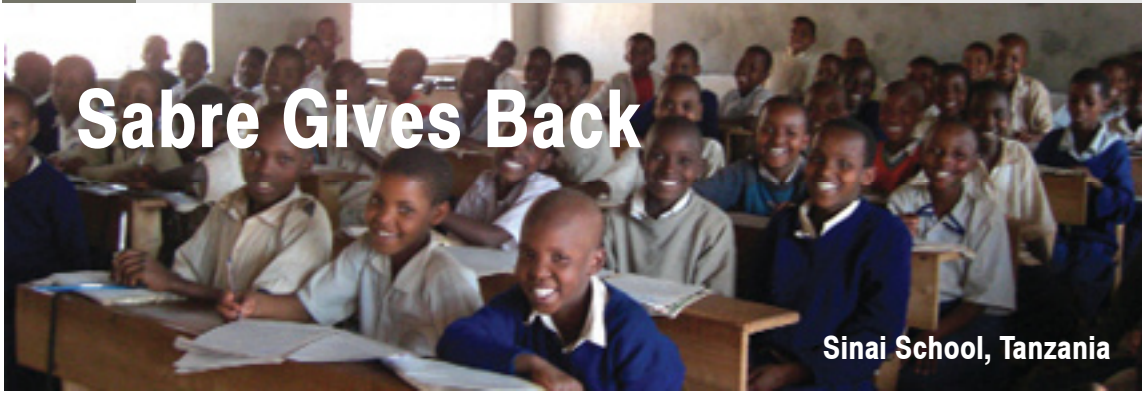
Sinai School, Tanzania